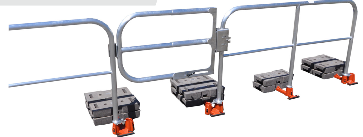
Gate installed on guard trac™ plus